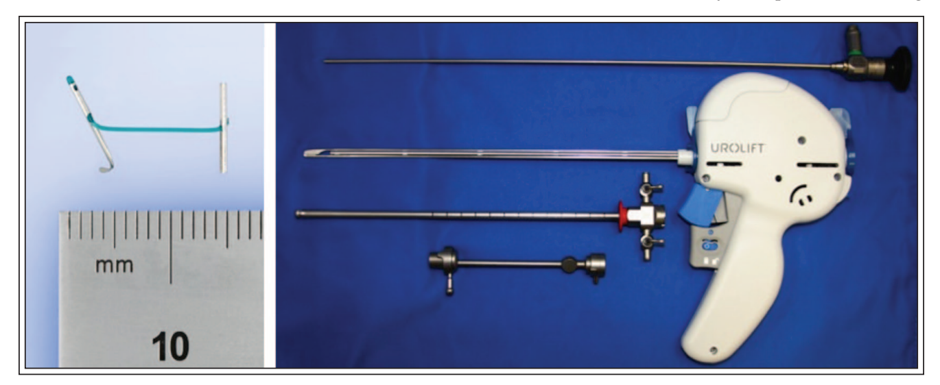
Figure 1. UroLift system and cystoscopy kit. a) Delivery system is composed of a handheld delivery device that fits into a Storz 20 F sheath and houses a Storz 2.9 mm 0 degree lens. A Storz custom bridge allows for 2.9 mm lens to be used for cystoscopy as well. b) The delivery device houses an implant consisting of a nitinol capsular tab (left), stainless steel urethral end piece (right) and a polyester monofilament. The actual length of monofilament delivered varies with each implant as the device tailors the implant to the prostatic wall thickness.

Experience has shown the most important component of local anesthesia is surgeon patience and communication. Adequate time must be given for the topical lidocaine and the preoperative sedation to take effect. Gentle and slow movements with the cystoscope while narrating