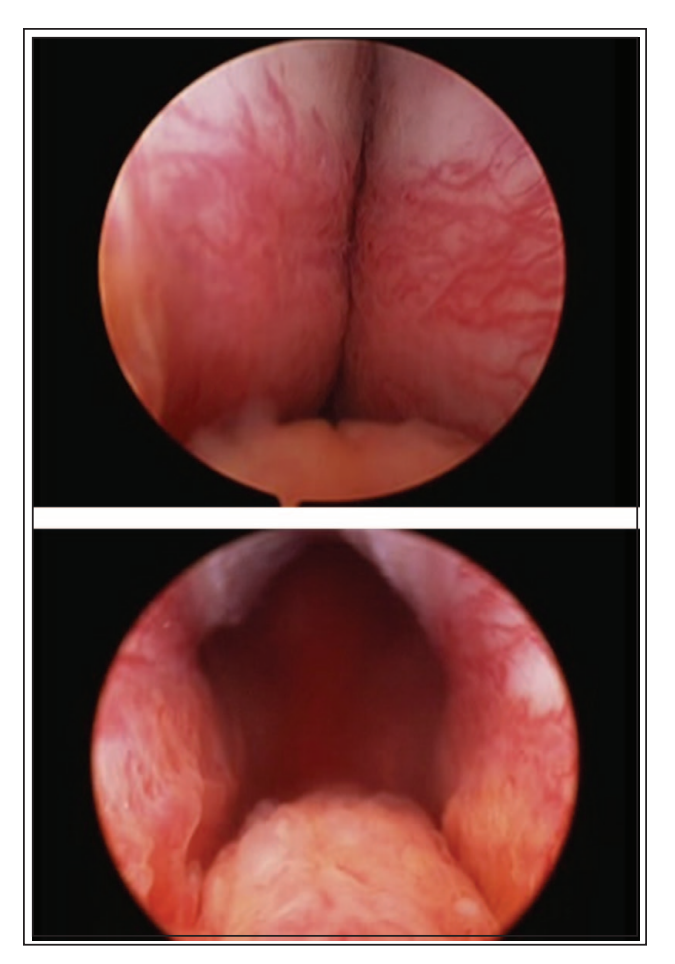
Figure 4. Prostatic Urethral Lift in a large prostate of 68 grams. a) Before treatment the lateral lobes are firmly apposed. b) Six UroLift implants hold back the prostatic lobes, creating a continuous anterior channel from bladder neck to veru montanum. While posterior tissue is apposed, the procedural goal in large prostates is a continuous anterior channel.

Figure 3. Distal deployment of the UroLift implant. When deploying distal implants the veru montanum should be apparent in the cystoscopic view to effectively address apical tissue.