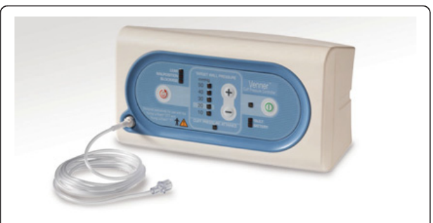
Figure 2 The PneuX System tracheal seal monitor.

This retrospective observational study was conducted at the Queen Elizabeth Hospital, Norfolk, UK with approval from the Local Research and Ethics Committee. Prospective approval was obtained to report data from our routine practice and for publication of